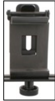
MDClip for iPhone, iPod touch, and SmartPhones