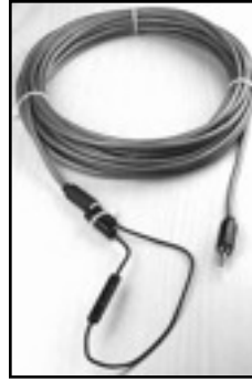
ProPrompter Wired Remote for ProPrompter App script control